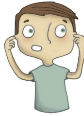
There is too much noise