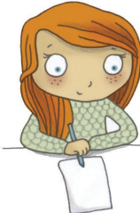
I would like to read, draw, colour