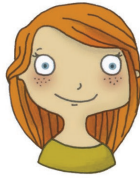
yes, I want