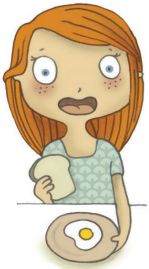
I am hungry