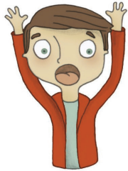
I am scared