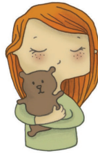
I would like my comforter, my doll