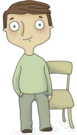
I would like to stand up