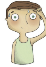
I am hot