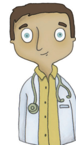
I would like to see the doctor