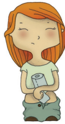
I need to pee, pooh