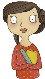
I would like to see the teacher