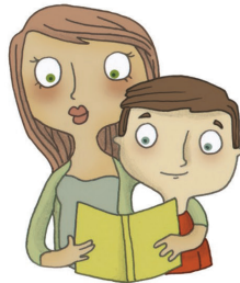
I would like to be told a story