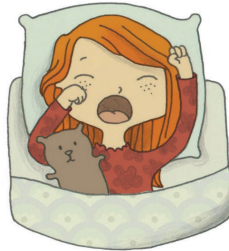
I had a nightmare