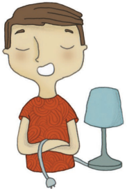
I would like to turn off the light