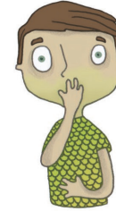
I want to throw up