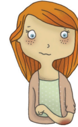
I have pain