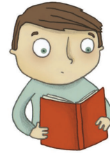
I would like to read