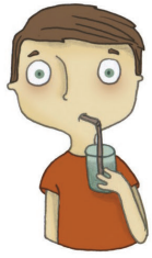
I am thirsty