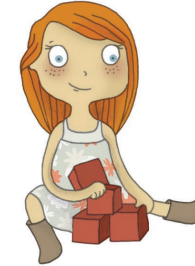
I would like to play