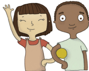
I would like to see my friends