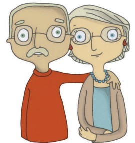
I would like to see Grandpa, Grandma