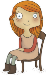
I would like to sit down