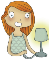
I would like to turn on the light