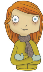
I am cold